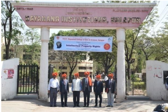
Welcome at the gate