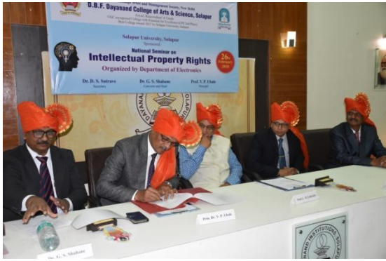
Signing of MOU between D. Y. Patil University, Kolhapur and DBF Dayanand College of Arts and Science, Solapur