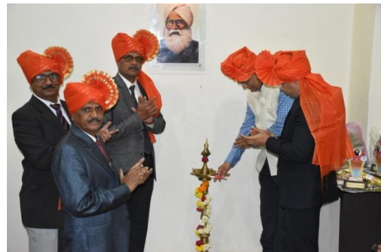
Inauguration at the hands of Chief Guest by lightning the lamp