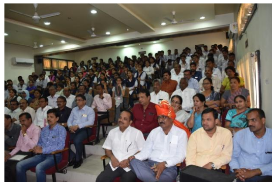
Audience of the Seminar on Intellectual Property Rights