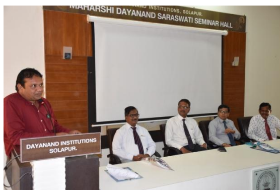
Feedback by the participants