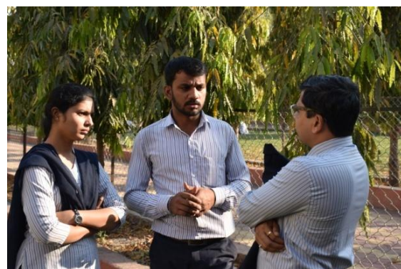
Interaction with research students