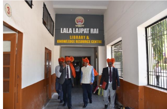
Visit to Knowledge Resource Centre