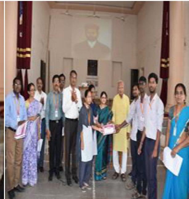
In-Charge of the Activity