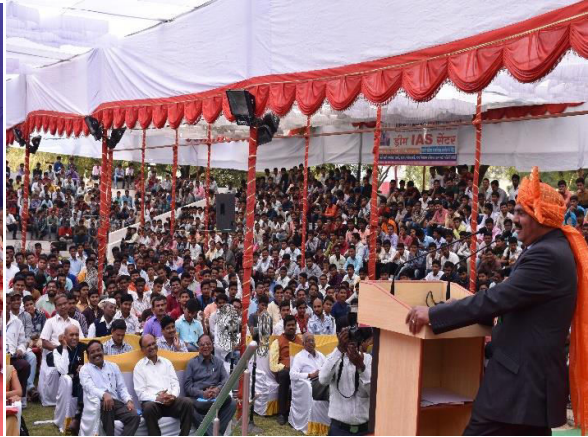
In-Charge of the Activity