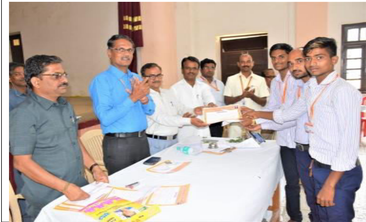
In-Charge of the Activity