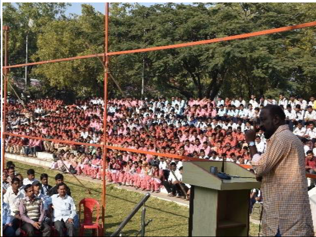
In-Charge of the Activity