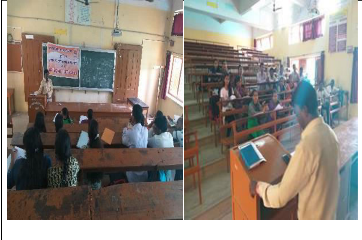
In-Charge of the Activity