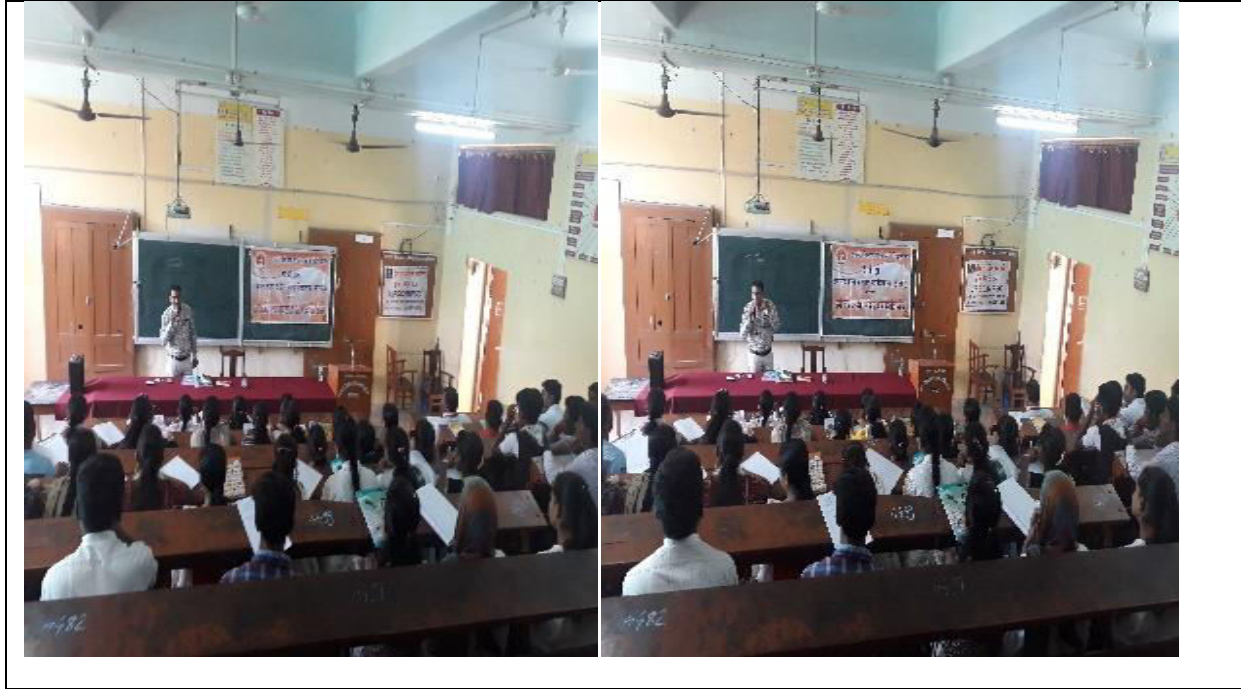
In-Charge of the Activity