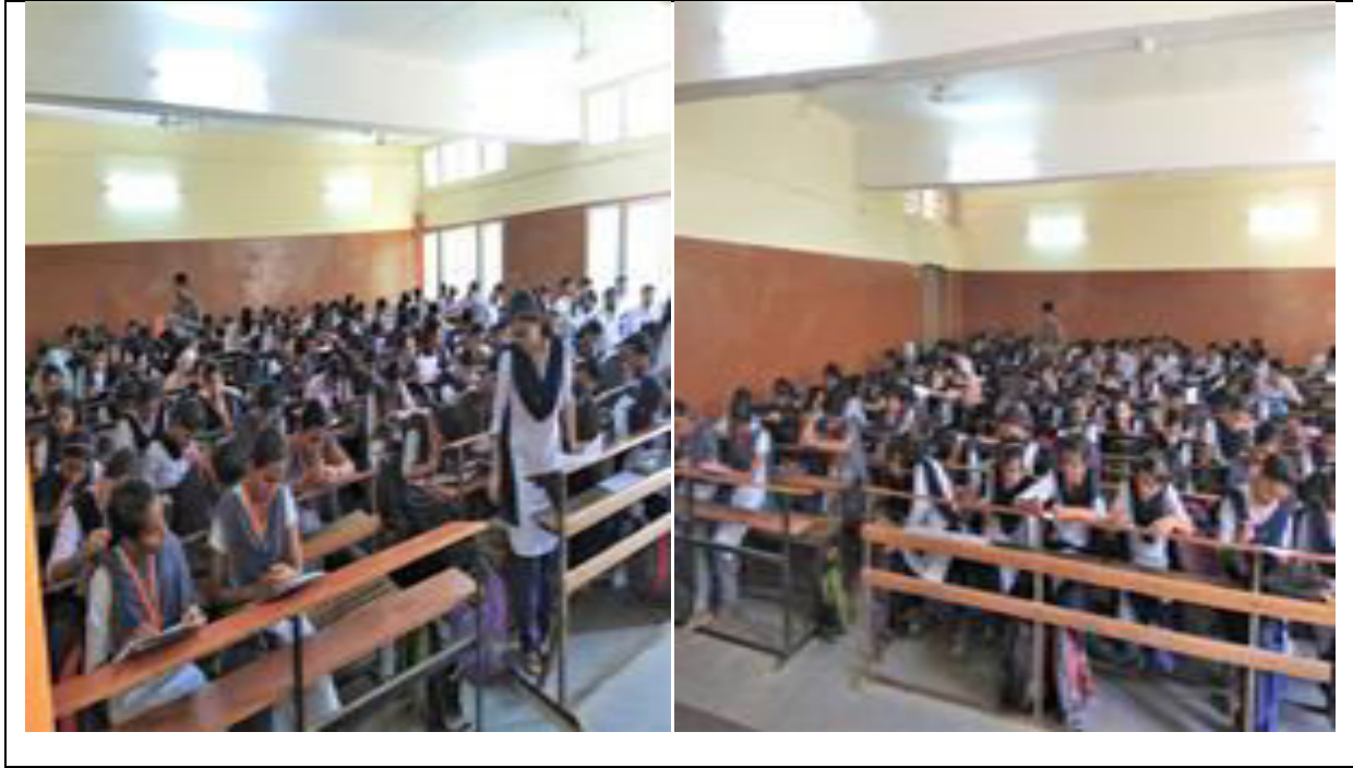
In-Charge of the Activity