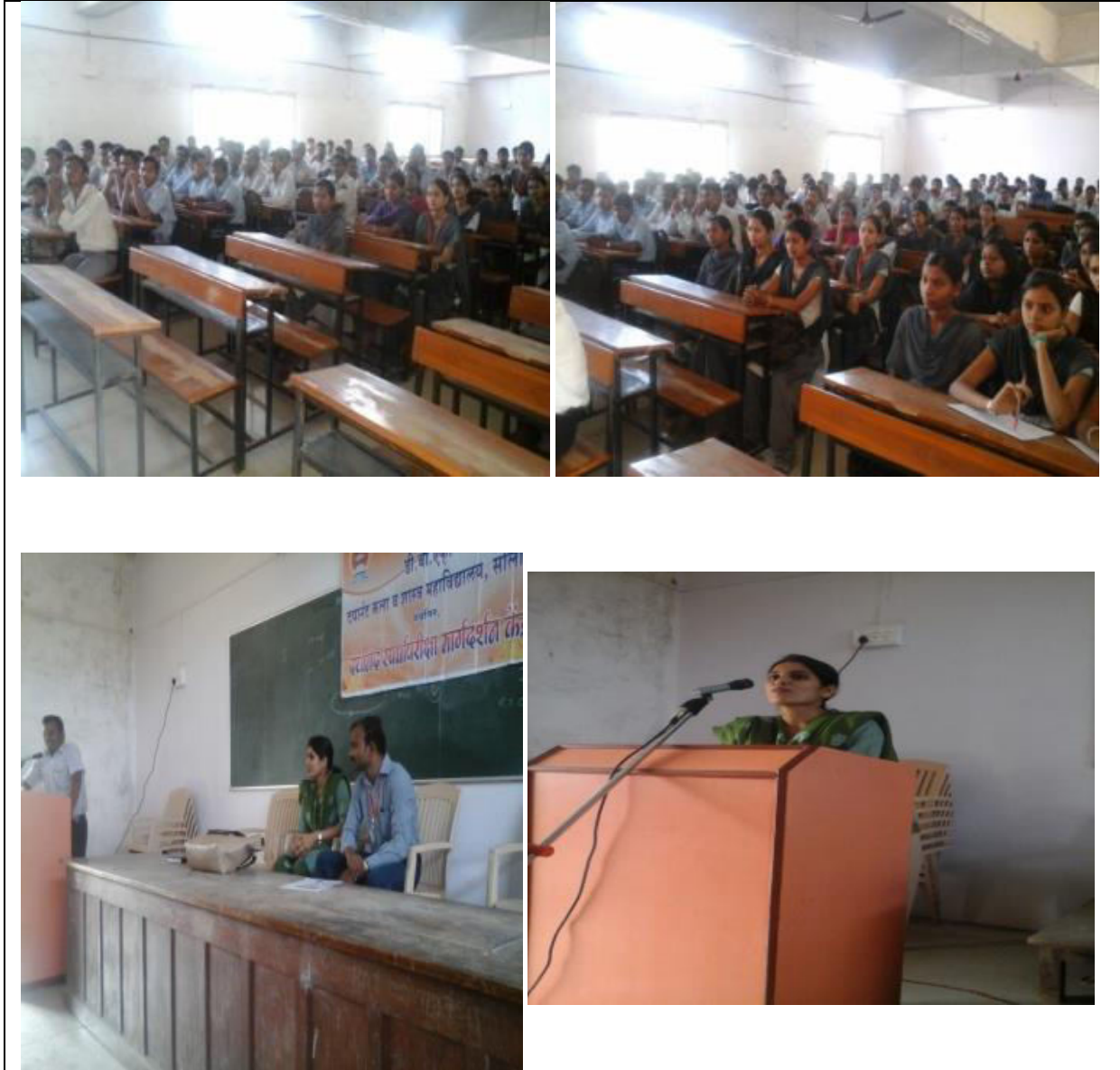
In-Charge of the Activity